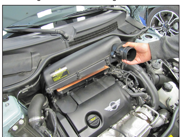
5. Remove the upper air box housing and air filter from the vehicle.

NOTE: K&N Engineering, Inc., recommends that customers do not discard factory air intake.