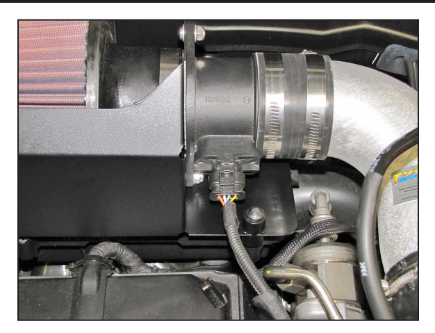
14. Reconnect the mass air sensor electrical connection.