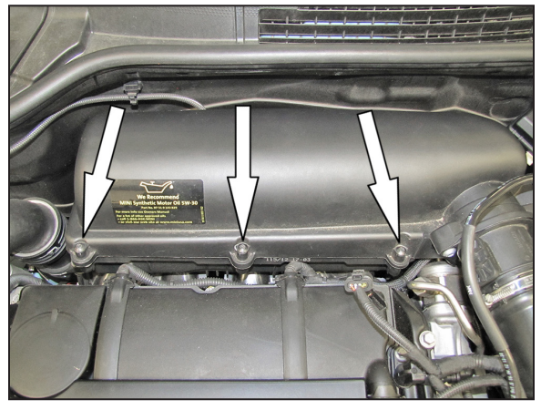
4. Loosen the three screws securing the upper air box housing to the lower housing.