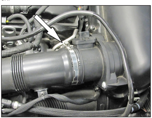
3. Loosen the hose clamp which secures the intake tube to the mass air sensor.