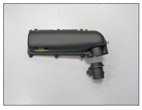
6. Remove the two screws securing the mass air sensor to the upper air box housing and then remove the sensor as shown.

NOTE: K&N Engineering, Inc., recommends that customers do not discard factory air intake.