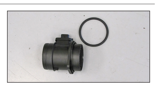
7. Remove the factory O ring from the mass air sensor.