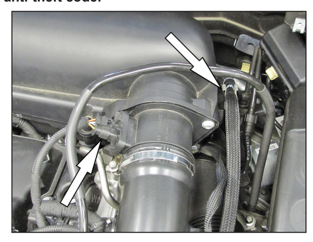
2. Disconnect the mass air sensor electrical connection and unhook the vent line from the air box.

NOTE: Disconnecting the negative battery cable erases pre-programmed electronic memories. Write down all memory settings before disconnecting the negative battery cable. Some radios will require an anti-theft code to be entered after the battery is reconnected. The anti-theft code is typically supplied with your owner's manual. In the event your vehicles' anti-theft code cannot be recovered, contact an authorized dealership to obtain your vehicles anti-theft code.