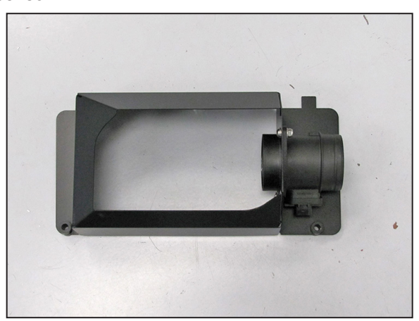
8. Install the mass air sensor into the K\&N^{\otimes} heat shield using the provided hardware.

NOTE: Be sure to install the button head bolts from the inside of the heat shield out.