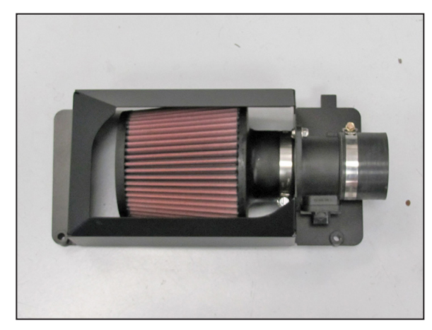
10. Install the provided silicone hose (08440) onto the mass air sensor and secure with the provided hose clamp.