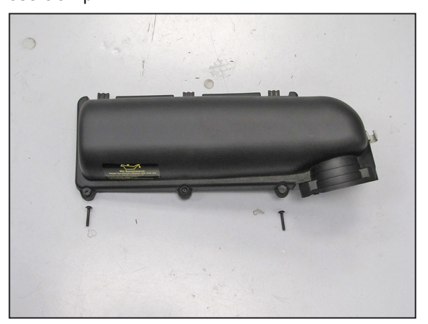
11. Remove two of the upper air box mounting bolts as shown.