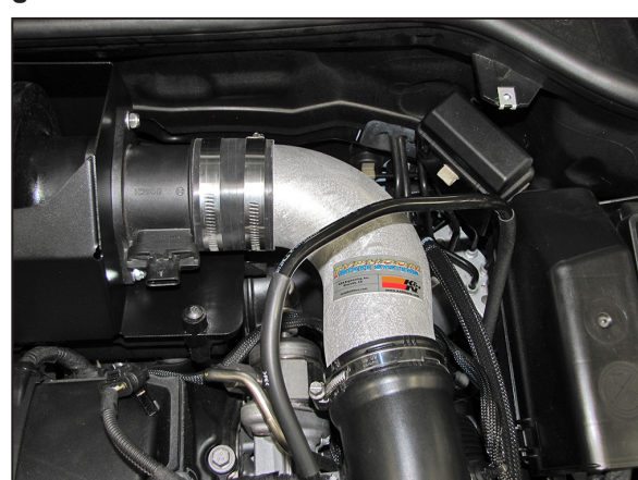
13. Install the K&N® intake tube into the factory intake hose and then into the silicone hose at the mass air sensor, then secure with the provided and factory hose clamp.

NOTE: If an aftermarket Strut Tower Brace is being used, clearance between the Strut Tower Brace and K&N heat shield may become too tight for the Brace to be used.