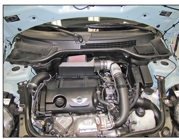
15. Reconnect the vehicle's negative battery cable. Double check to make sure everything is tight and properly positioned before starting the vehicle.

16. It will be necessary for all K&N® high flow intake systems to be checked periodically for realignment, clearance and tightening of all connections. Failure to follow the above instructions or proper maintenance may void warranty.