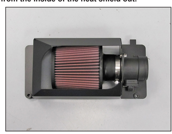
9. Install the K&N® air filter onto the mass air sensor inside the heat shield and secure with the provided hose clamp.

NOTE: Be sure to install the button head bolts from the inside of the heat shield out.