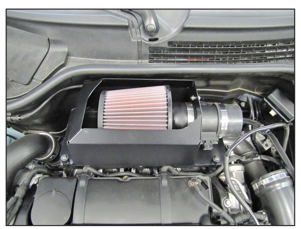
12. Install the K&N® heat shield assembly onto the factory lower air box and secure with the factory bolts from step #12.

NOTE: If an aftermarket Strut Tower Brace is being used, clearance between the Strut Tower Brace and K&N heat shield may become too tight for the Brace to be used.